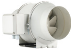
HIGH FLOW MIXED FLOW FAN 150MM