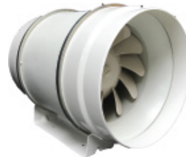
HIGH FLOW MIXED FLOW FAN 200MM