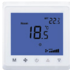
SYSTEM CONTROLLER VENTILATION / HEAT TRANSFER