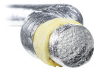
LOW RESISTANCE DUCTING HIGHEST INSULATION RATING