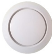
HIGH VELOCITY CONE DIFFUSER 125MM / 150MM