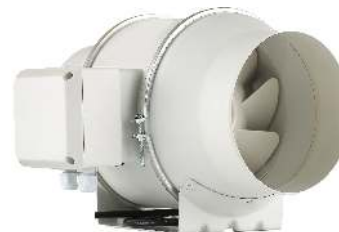
HIGH FLOW MIXED FLOW FAN 150MM