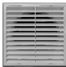
LOUVRE GRILLE 125MM / 150MM