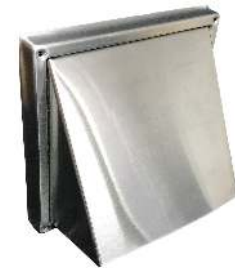
STAINLESS STEEL COWL 125MM / 150MM