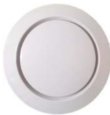
HIGH VELOCITY CONE DIFFUSER 125MM / 150MM