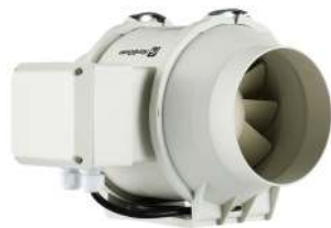
HIGH FLOW MIXED FLOW FAN 125MM