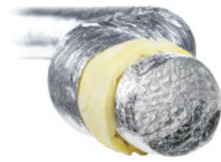
LOW RESISTANCE DUCTING HIGHEST INSULATION RATING