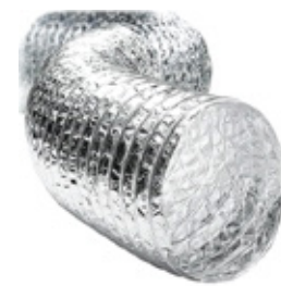
ALUMINIUM NUPE DUCTING