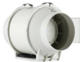
HIGH FLOW EC MIXED FLOW FAN