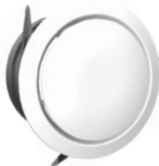
HIGH VELOCITY CONE DIFFUSER